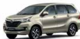
Gold leaf Metallic T23