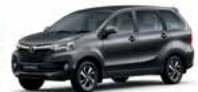
Graphite Grey Metallic IG3