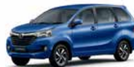
Cosmic Blue 8X2