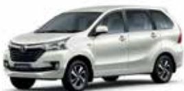
Tusk White W09