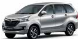
Quicksilver Metallic 1E7